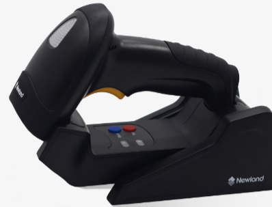
HR15 BT Wahoo handheld scanners