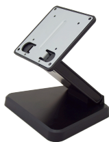
Foldable Desktop Stand