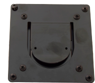
VESA Wall Mount

Newland EMEA HQ +31 (0) 345 87 00 33 info@newland-id.com