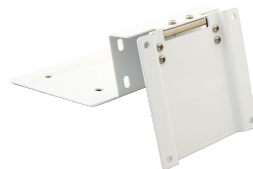
VESA Magnetic Shelf Stand