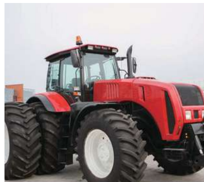
Automatic Driving of Agricultural Machinery